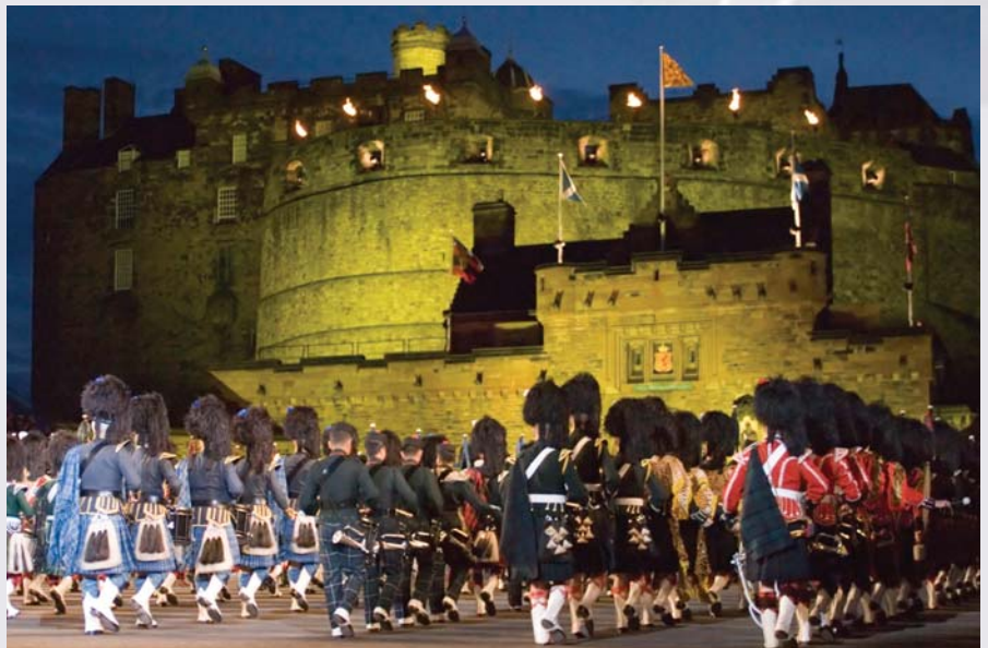
Royal Edinburgh Military Tattoo

Bon Voyage from the Cruise Express Team!