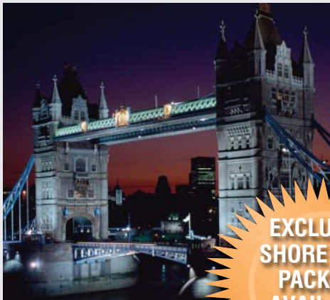
Tower Bridge, London