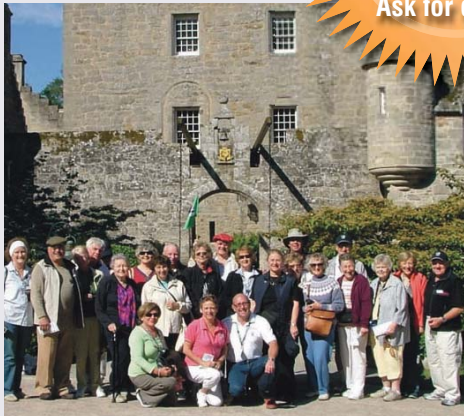
Cruise Express group at Cawdor Castle

EXCLUSIVE SHORE TOUR PACKAGE AVAILABLE Ask for details